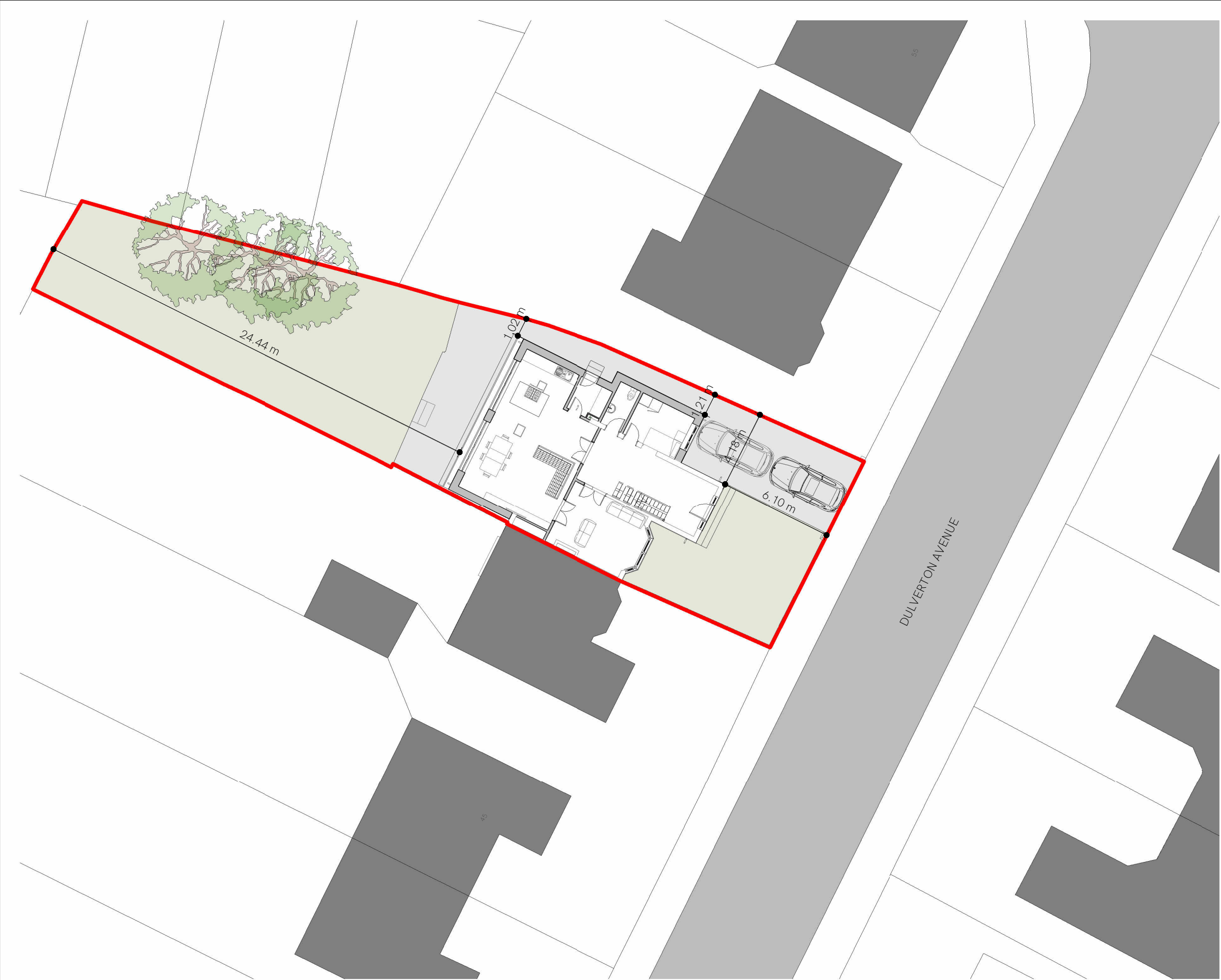
1 Site Plan - Proposed 1 : 200

Reproduced from OS Plan by permission of the ordnance survey on behalf of her majesty's stationary office (C) Crown Copyright License No. LIG 0288 General Notes Contractors are to check dimensions of all issued drawings and to notify the Architect immediately of any discrepancy. Do not scale from this drawing, if dimensions are not clear ask. This drawing and the information contained herein are subject to BGA Architects Terms & Conditions. Do not build from any drawing packages that do not say, Building Control Approval, Conditional BREG Approval or For Construction